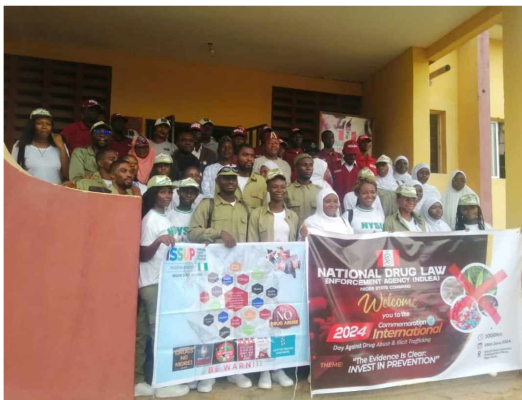
A cross section of participants