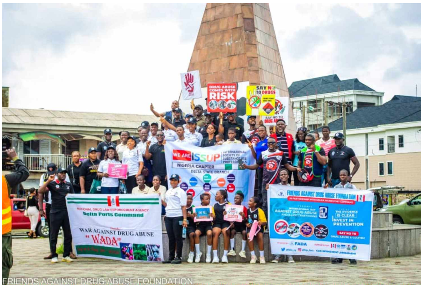
ISSUP Delta during a drug abuse prevention road walk

The International Society of Substance Use Professionals (ISSUP) Delta state branch, in collaboration with the National Drug Law Enforcement Agency (NDLEA) Port Command, successfully commemorated the International Day Against Drug Abuse and Illicit Trafficking on 26 June 2024. This year's event centred on the theme, "The Evidence is Clear: Invest in Prevention," highlighting the critical need for community awareness and action against drug abuse.