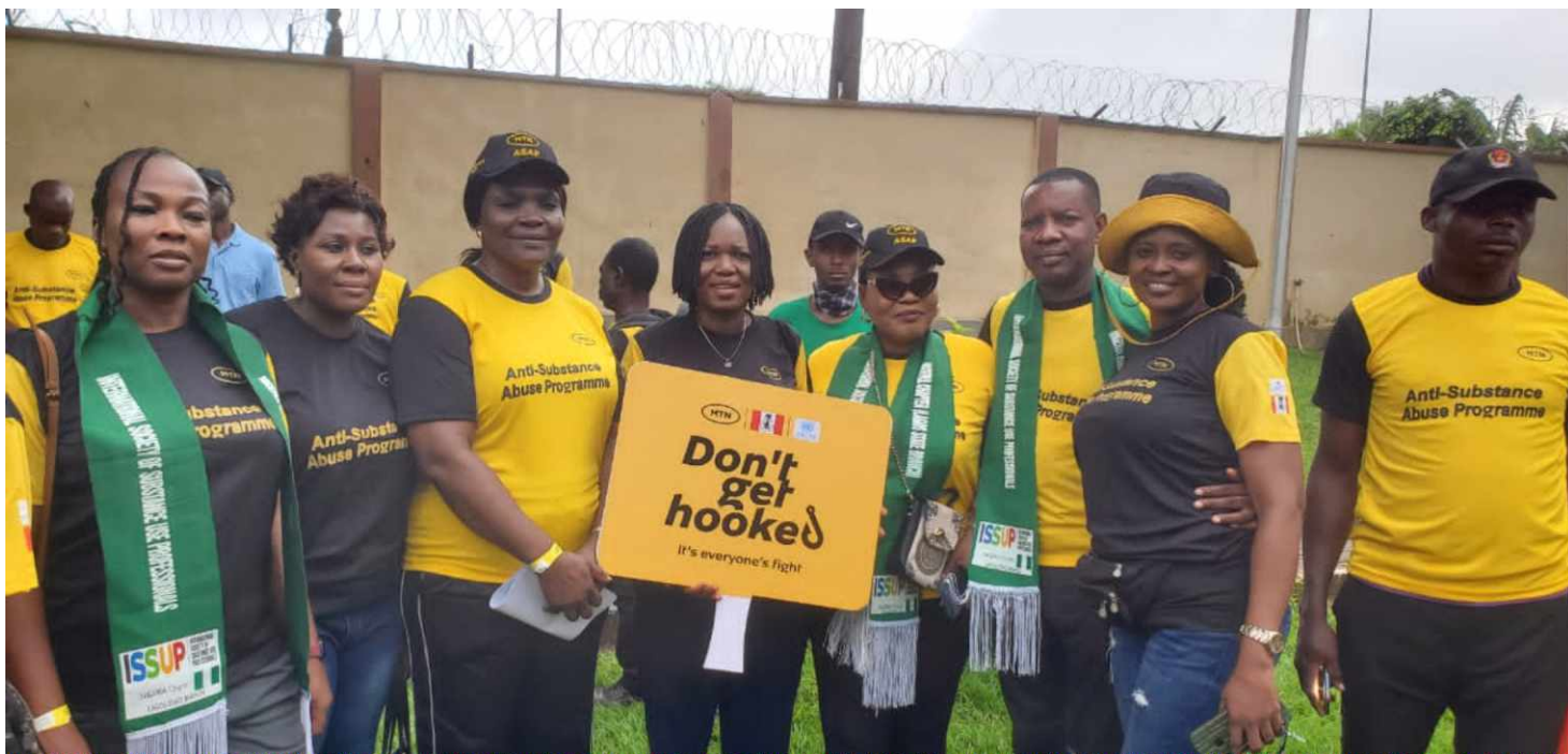
At walk/Rally organized by the National Drug Law Enforcement Agency (NDLEA), Lagos State Command