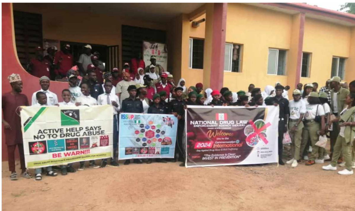
Students, NYSC members, NDLEA and other participants at the June 26th event in Niger state

The event was a resounding success, reinforcing the importance of investing in prevention and highlighting the critical role that education, awareness, and community engagement play in addressing the challenges of drug misuse.