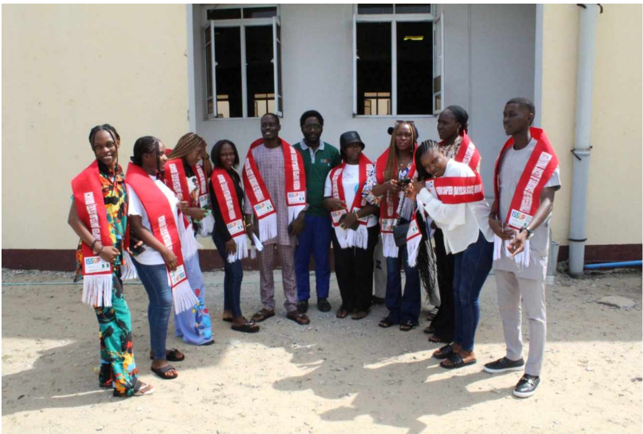
Undergraduate students' wing of ISSUP Bayelsa Branch newly inducted

The well-being of professionals in substance use prevention is integral to the success of Nigeria's healthcare system, particularly in Bayelsa state. By addressing the mental health needs of both prevention professionals and those they serve, ISSUP Bayelsa is committed to fostering a supportive environment that enhances care quality and improves outcomes. This investment is not only necessary but also a testament to the shared commitment to a healthier and more resilient future for all.