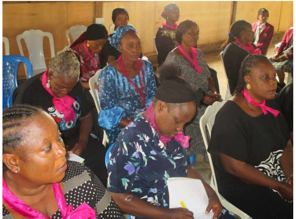
Participant at the June 26th event in Kaduna