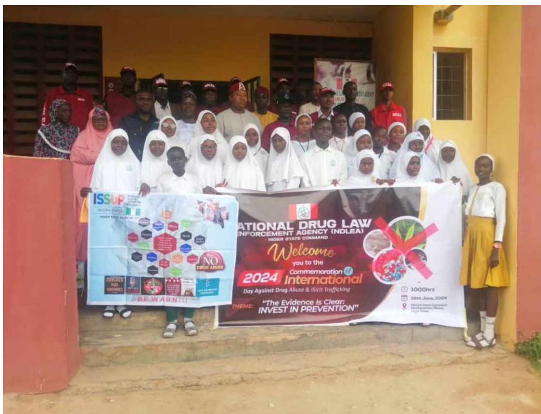
Participants at the 1st Niger State National Drug IQ Quiz competition

The commemoration began with the 1st Niger State National Drug IQ Quiz competition, held between 11th and 20th June 2024. The competition, designed for secondary schools across the state, engaged students in a dynamic and educational format, testing their knowledge on drug prevention, the dangers of substance misuse, and the importance of maintaining healthy lifestyles. This interactive platform helped raise awareness and encouraged youth involvement in the fight against drug abuse.