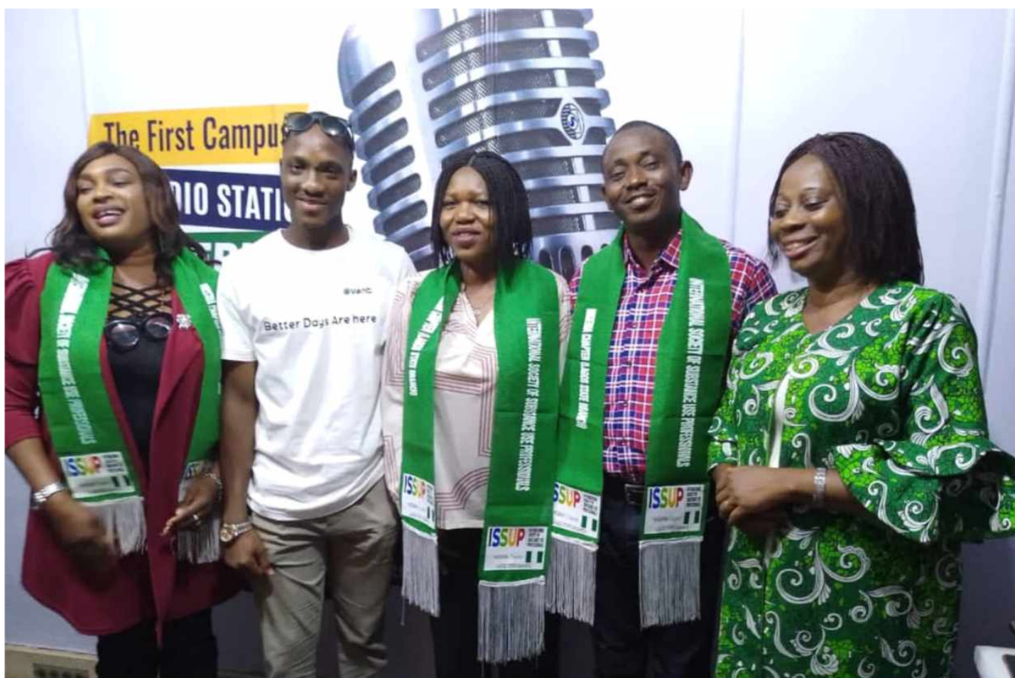
ISSUP Lagos Features on UNILAG FM

These events reflect ISSUP Lagos branch's continued commitment to raising awareness and taking action against substance abuse, while promoting healthy living and community well-being in Lagos State.