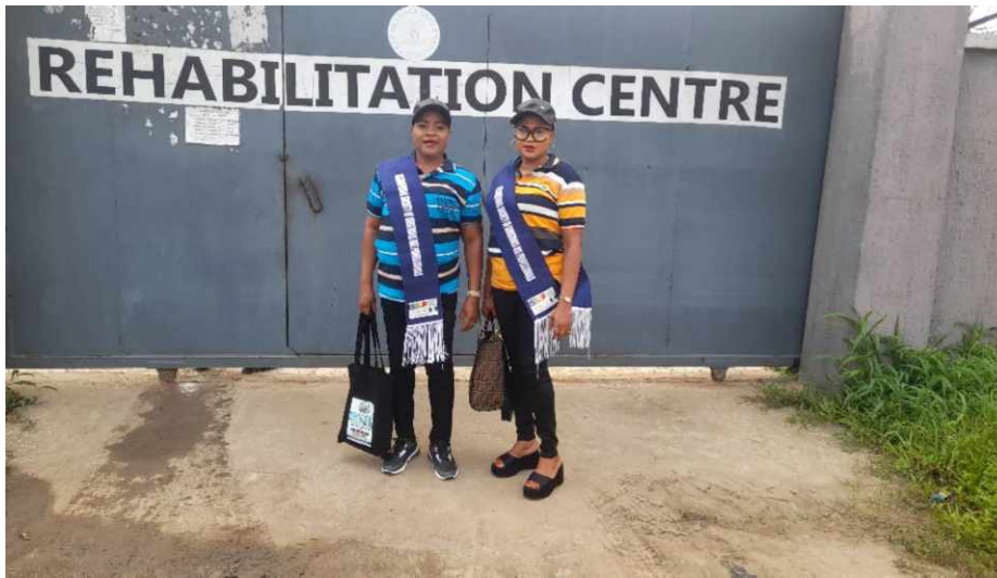
ISSUP Rivers members at a local rehabilitation centre in Iriebe

On 26th June 2024, the Rivers State branch of the International Society of Substance Use Professionals (ISSUP) commemorated World Drug Day with a significant visit to a local rehabilitation centre in Iriebe. In line with the global theme, “Evidence is Clear: Invest in Prevention,” the event underscored the importance of drug abuse prevention and rehabilitation, while highlighting the essential role of community support in addressing substance use disorders.