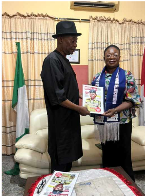
Courtesy visit to the NDLEA