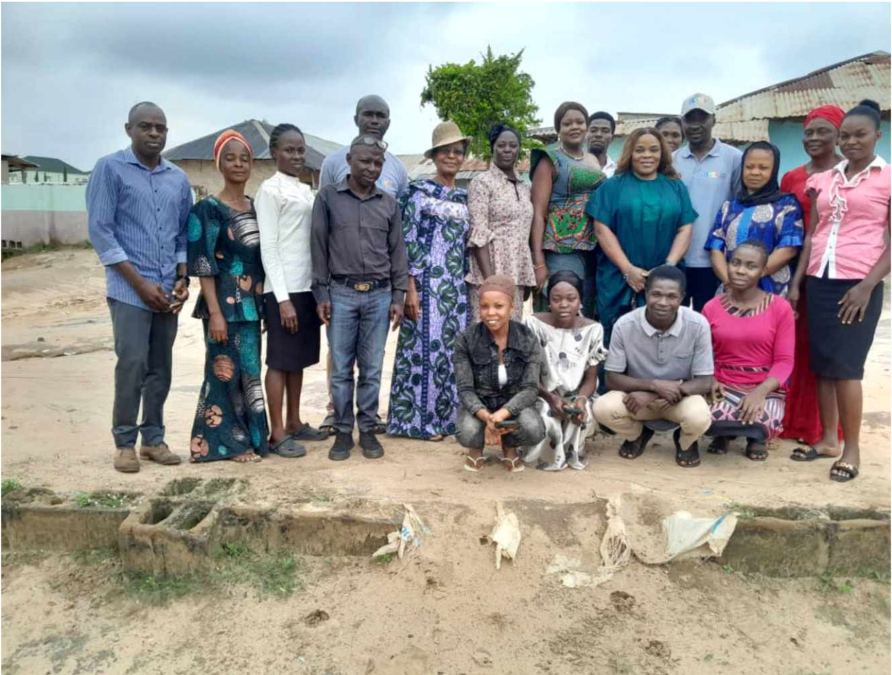
ISSUP FCT members with students of Peace school

benefits of staying drug-free. The school staff also received training on how to spot early signs of drug use and how to guide and support their students effectively.