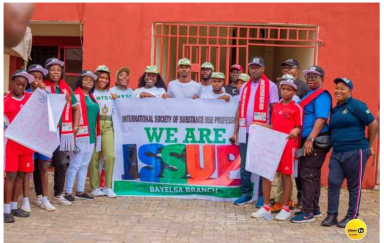
ISSUP representatives at the NDLEA Office Okaka Yenagoa after a road sensitization walk

As part of its commitment to drug demand reduction, ISSUP Bayelsa supported World Drug Day with activities extending from street markets to motor parks. A road walk, organised in collaboration with the National Drug Law Enforcement Agency (NDLEA), culminated in a colourful visit to the NDLEA state command. The event highlighted the importance of ongoing community education on drug hazards.