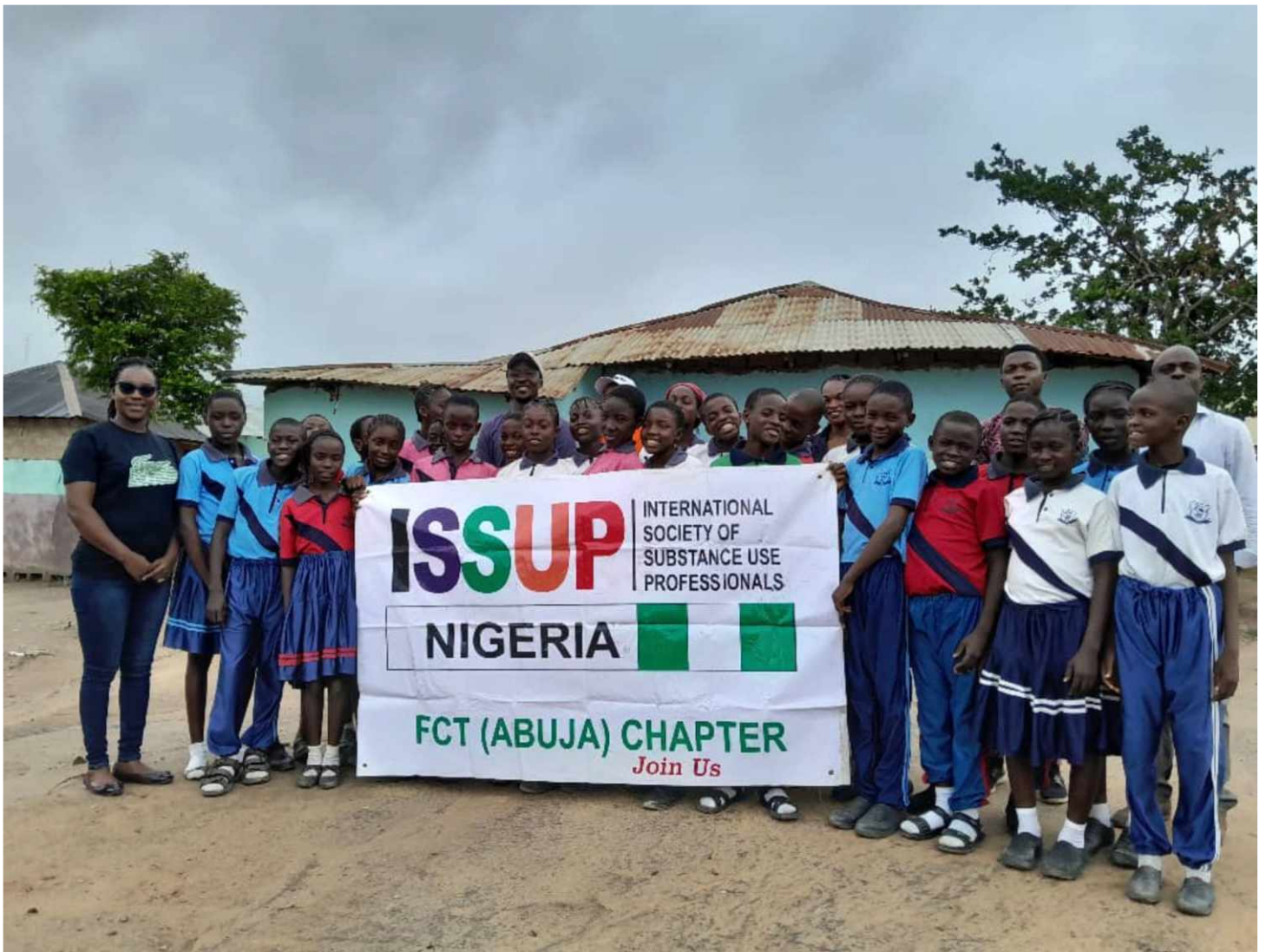
ISSUP FCT members with students of Fortune Victory school

On 26 June 2024, to mark the International Day Against Drug Abuse and Illicit Trafficking, ISSUP Abuja FCT branch held a key drug prevention Sensitisation programme at Fortune Victory and Peace School, Pigba Kasa, Apo. This event aimed to raise awareness about drug abuse and reduce the demand for drugs by involving both students and staff in the conversation.