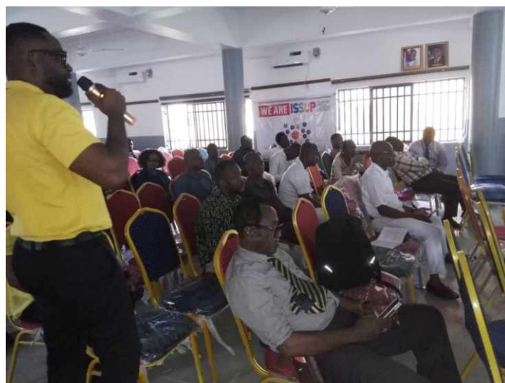
At the Lecture organised in collaboration with FNPH

Finally, to wrap up the week's activities, ISSUP Cross River State joined the Cross River State Command of the National Drug Law Enforcement Agency (NDLEA) for a road walk. This event raised awareness about the dangers of drug abuse and showed how collective action can help build safer, drug-free communities.