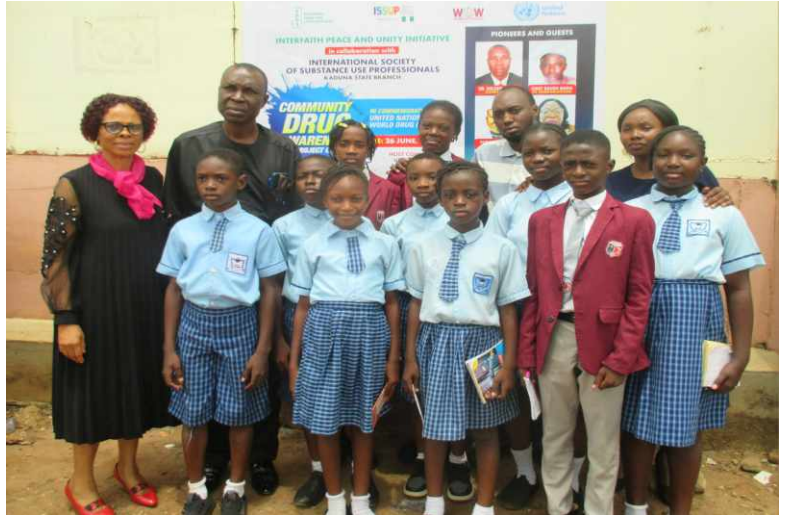
ISSUP Delta during a drug abuse prevention road walk

On 26th June 2024, the Kaduna state branch of ISSUP (International Society of Substance Use Professionals), in collaboration with the Interfaith Peace and Unity Initiative, organised a significant community outreach programme in commemoration of World Drug Day. This year's theme, “Invest in Prevention,” guided the day's activities, aiming to raise awareness about substance use and mental health.