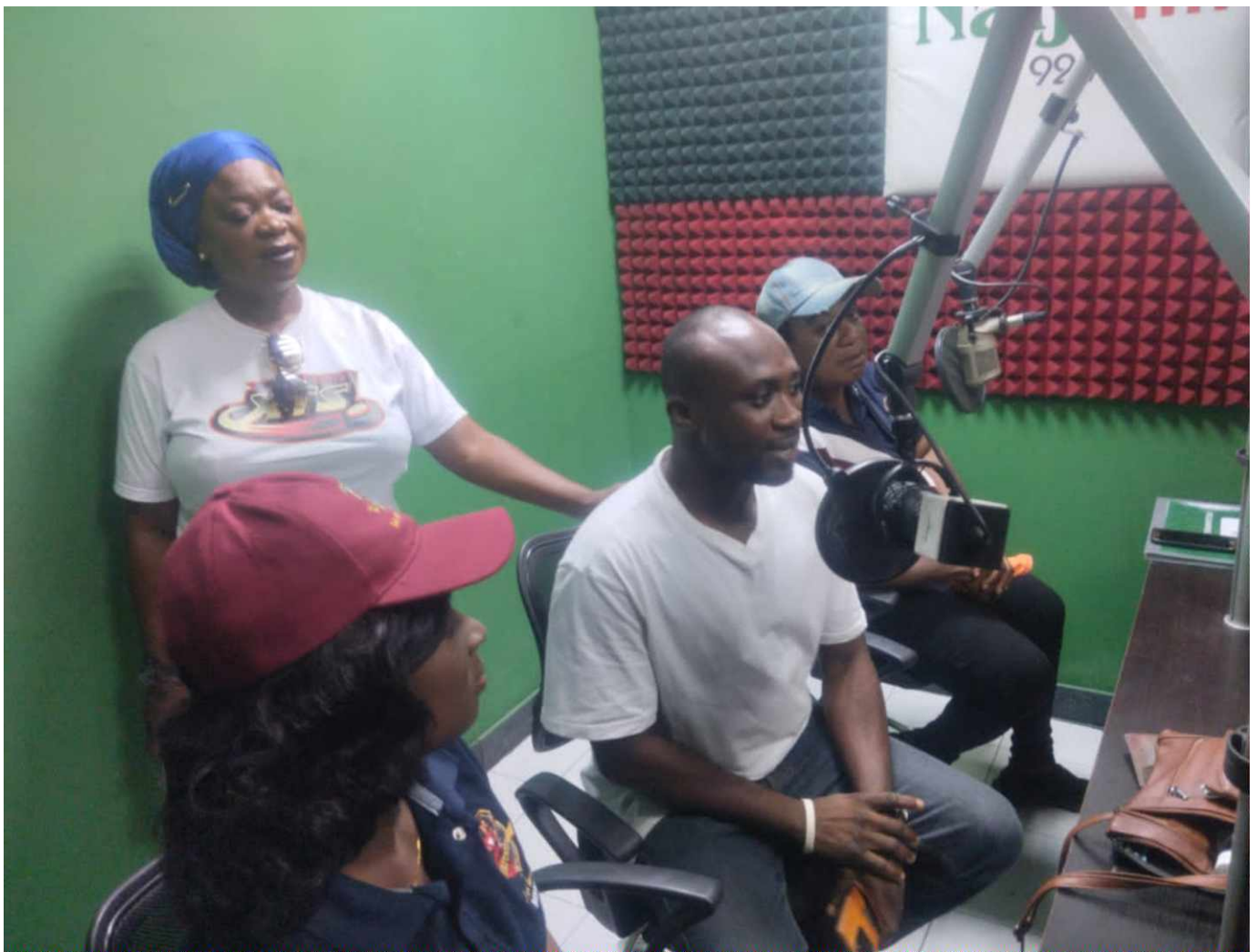
Radio program by ISSUP Rivers state branch

ISSUP Rivers state's recent activities highlight their commitment to substance abuse prevention and the promotion of rehabilitation. Their collaboration with rehabilitation centres, government agencies, and media outlets underscores the multi-faceted approach required to effectively tackle drug abuse. By investing in prevention and promoting greater awareness, ISSUP Rivers state continues to work towards a future where individuals and communities are empowered to overcome the challenges of substance use and build healthier, drug-free lives.