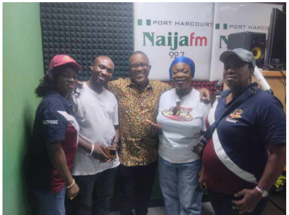
Advocacy and awareness creation at a radio station

During the radio session, ISSUP representatives discussed the dangers of drug abuse, available resources for prevention and rehabilitation, and the crucial role communities play in combating substance use. The campaign was well received, sparking public discourse and reinforcing the need for community engagement in addressing substance use disorders.