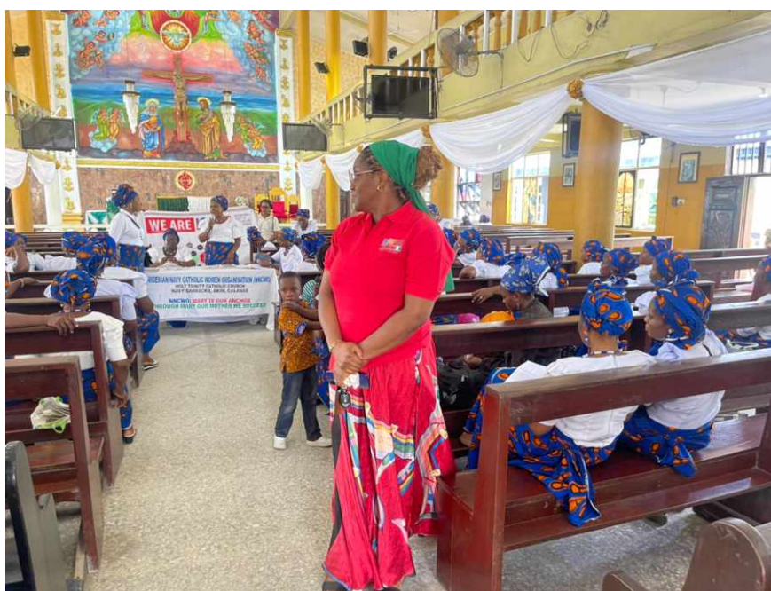
Advocacy visit to Nigerian Navy Catholic Women

Through these World Drug Day activities, ISSUP Cross River State demonstrated the importance of working together to prevent drug use. By educating young people, advocating for change, and engaging the community, the branch continues to promote a drug-free future for Nigeria's youth.