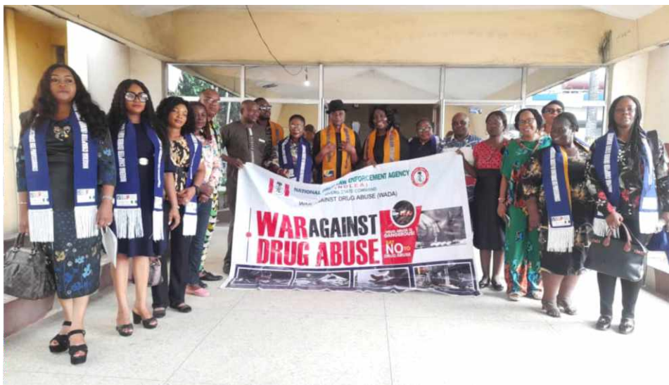
Representative of ISSUP Rivers State with the Rivers State Coordinator, NDLEA, during a courtesy visit to the NDLEA Commander

In a bid to extend their advocacy efforts, the ISSUP Rivers State team also visited the Federal Road Safety Corps (FRSC) on the same day. The sector commander warmly received the team and expressed a keen interest in supporting ISSUP's mission. He extended an invitation for ISSUP to collaborate with the FRSC's Special Marshal Corps, offering specific roadside locations where ISSUP could raise awareness about the dangers of drug use, smoking, and managing stress among drivers.