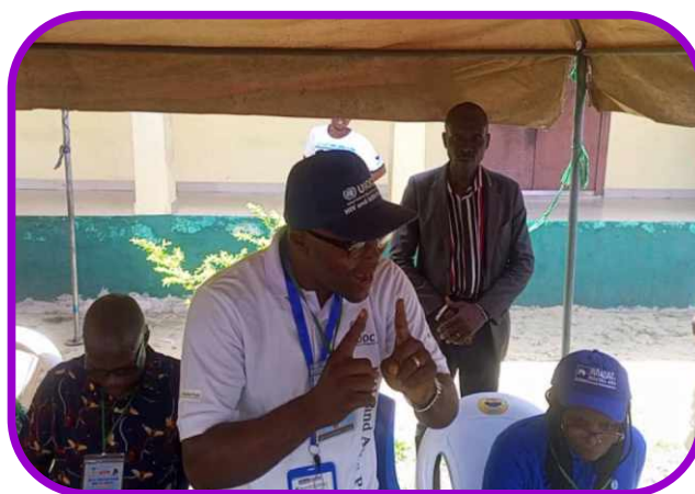
Background pictures to commence the training

The Bayelsa Drug Committee's report indicates that Bayelsa has the third-highest rate of drug use among young people in Nigeria, prompting immediate action. In response, the Bayelsa State Government established the Bayelsa State Drug Abuse Control Committee on March 16, 2021, in Yenagoa. ISSUP Bayelsa branch has since partnered with the state's rehabilitation committee to tackle substance abuse. Their efforts focus on raising awareness, promoting