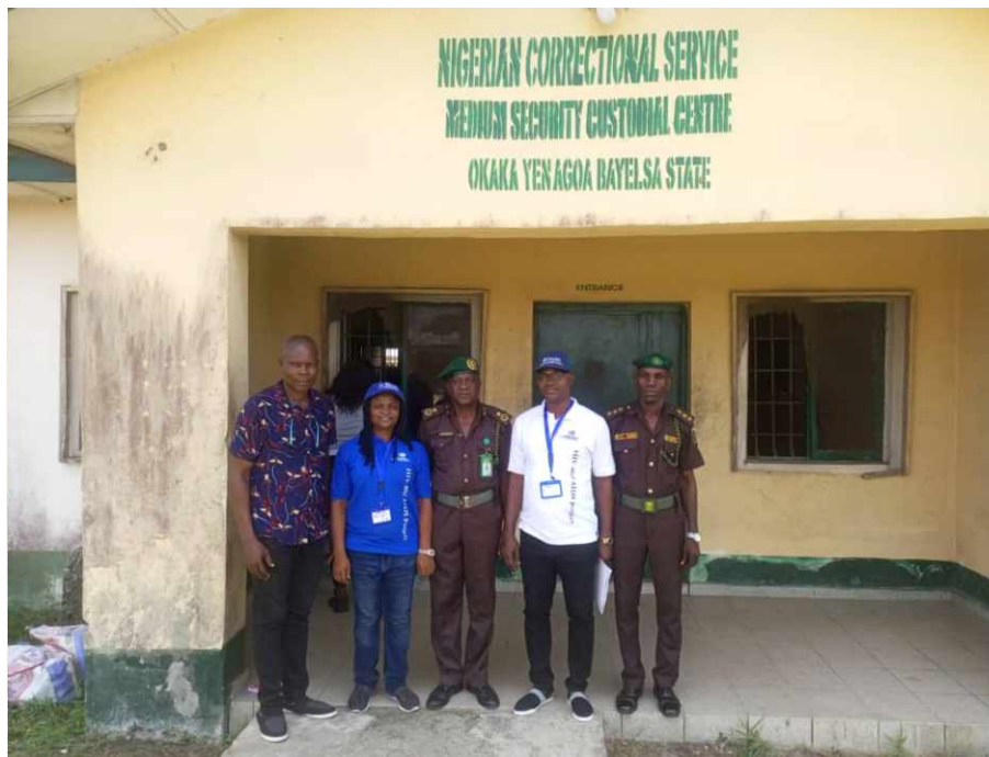
Visit to Bayelsa Correctional Centre

choices about their drug use. A follow-up visit included wellness outreach, screening, and treatment programmes for both inmates and officers, with plans for drug relief materials in future visits.