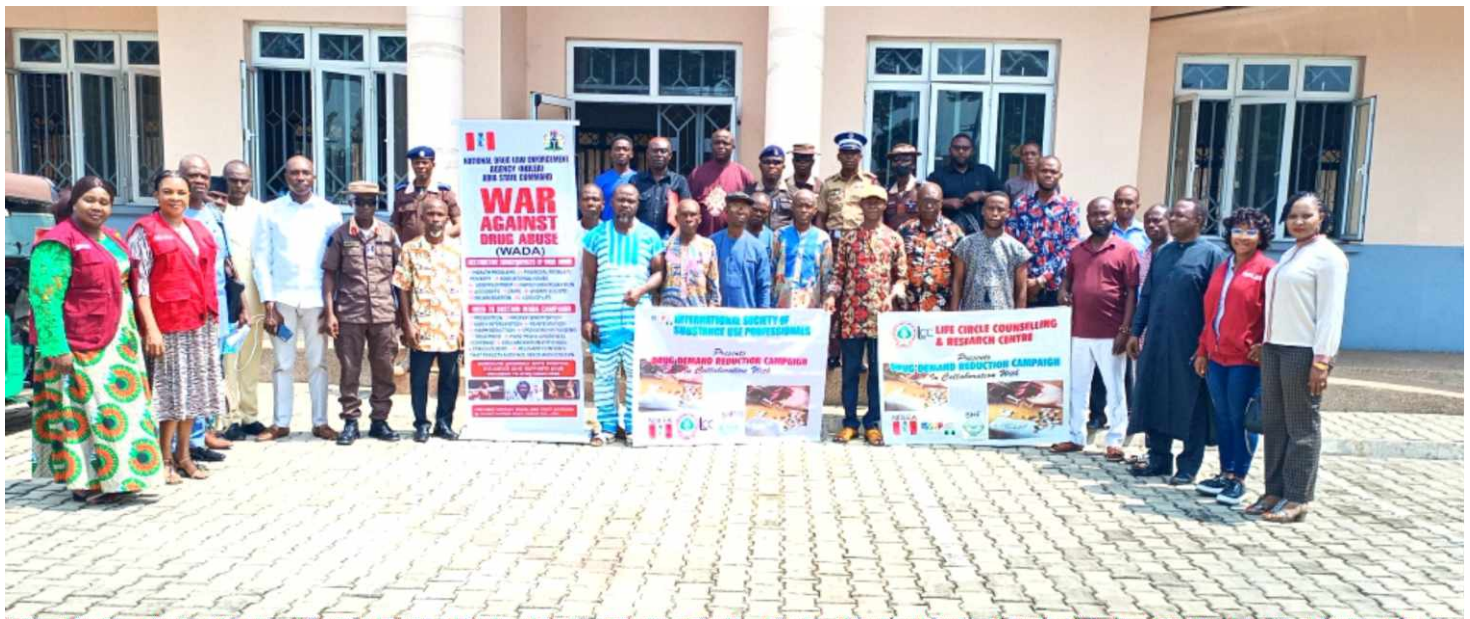
Representatives of the NDLEA, participants and ISSUP Abia branch members after the training

The seminar was attended by key stakeholders, including representatives from the National Drug Law Enforcement Agency (NDLEA), the Nigerian Security and Civil Defence Corps (NSCDC), Vigilante Groups, Man O' War, and members of the public.