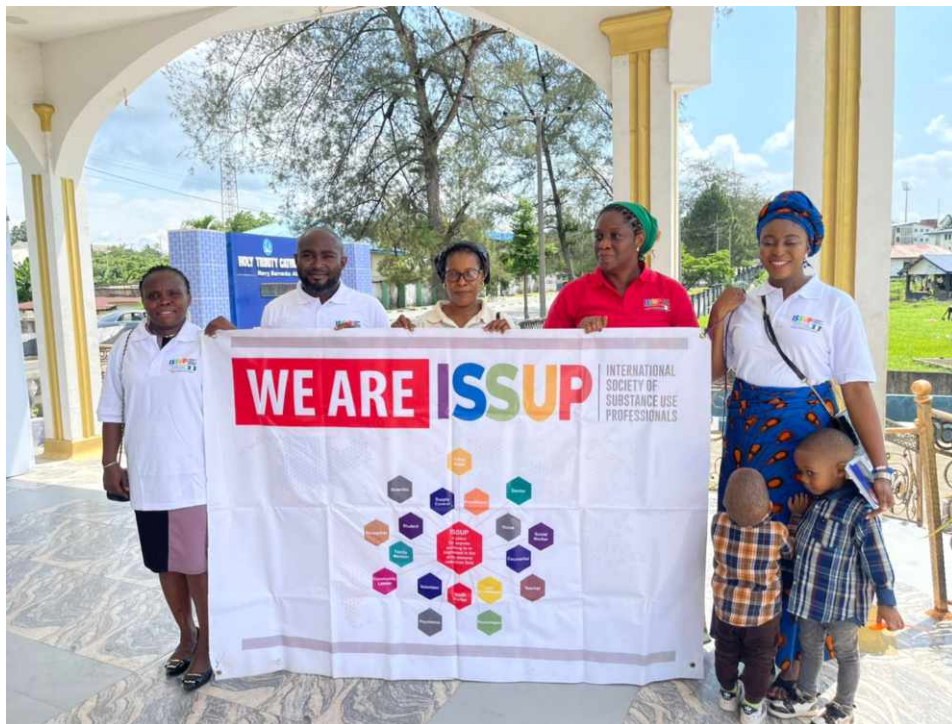
Advocacy visit to Nigerian Navy Catholic Women

To mark the 2024 World Drug Day, the International Society of Substance Use Prevention and Treatment Professionals (ISSUP) Cross River state branch organised a series of activities aimed at raising awareness and promoting the prevention of drug use in local communities.